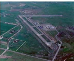
Can Byron handle cargo operations? We may soon know.

The tour's final stop is the ARFF (Aircraft Rescue and Fire Fighting) truck. Airport Operations Specialists explain what they do and how they are able to keep everyone safe at the Airport (Plus the kids love when they spray water from the truck's turrets). Tours take about an hour dependent upon the group size.