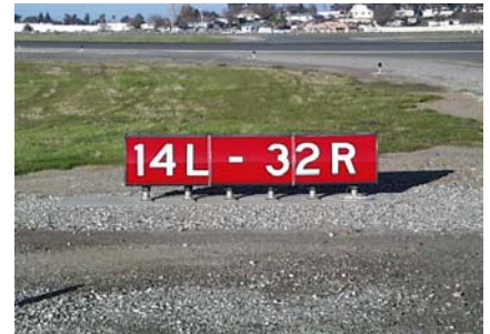
Newer signage will remain

The project will include significant power upgrades to the FAA Tower and airfield. Additionally, the number of airfield signs will increase from approximately 100 to 185. These new signs will meet the current FAA Advisory Circular standards for airfield signs.