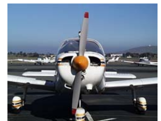
Just being mindful helps the problem.

A little caution and consideration can prevent a lot of damage.