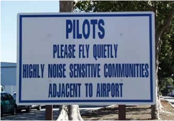
Pilots, thank you for Flying Buchanan Field and Byron Airports