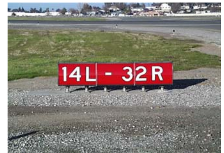
The older signs will be replaced to look like the newer, modern signs, as well as the addition of 100 new signs.